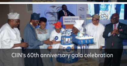
CIIN's 60th anniversary gala celebration