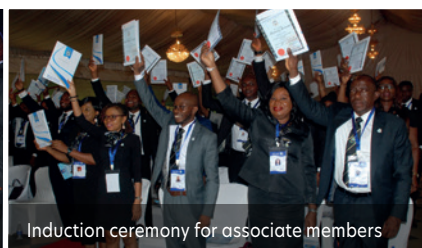
Induction ceremony for associate members