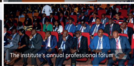
The institute's annual professional forum