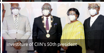
Investiture of CIIN's 50th president