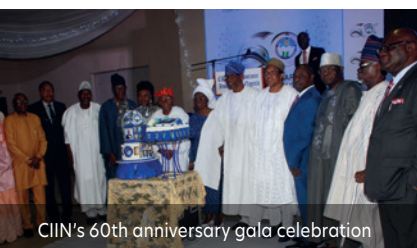
CIIN's 60th anniversary gala celebration

Founded in 1959, the institute was referred to as the Insurance Institute of Nigeria until February 1993,