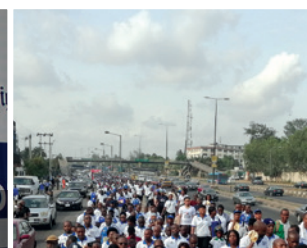
Fitness programme to raise insurance awareness