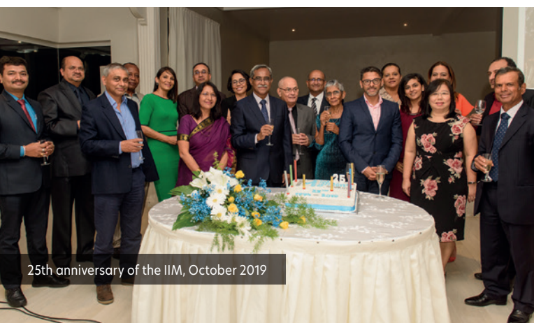
25th anniversary of the IIM, October 2019