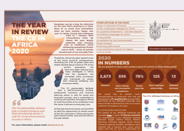
See the report > The Year In Africa 2020: The CII in Africa