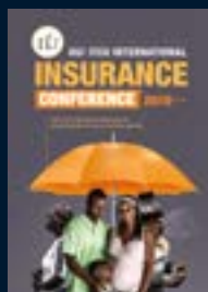
ITC - The role of inclusive insurance in delivering the social protection agenda