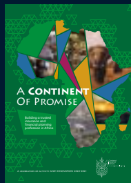
A Continent Of Promise: Celebrating the African insurance profession