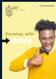
CII membership guide