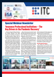
ITC - Insurance professional institutions - key key drivers in pandemic recovery