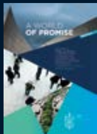
A World Of Promise: Celebrating the international insurance profession